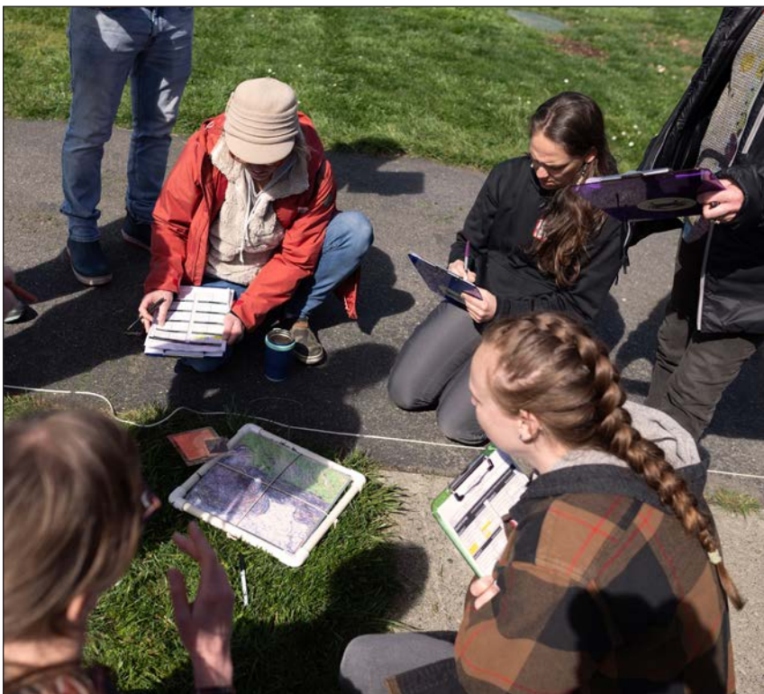
Left: volunteers learn Molt Search protocols at a training in Padilla Bay.

So how is it going so far? As of this writing, Molt Search had already recorded about 400 beach surveys input by more than 120 individual volunteers in different parts of Washington — sufficient, Watkins notes, to give WSG Crab Team and its partners “a really good dataset to work with.” As Crab Team focuses heavily on the early detection of green crab, this new, robust data is all the more important. Molts can serve as a window into all sorts of information about crab activity in an area. They indicate, first of all, that crabs are growing and therefore surviving well. They're also helping researchers learn more in real time about the connection between where molts are found and where crabs are actually living. Molt Search is even helping to build data about Dungeness crab, whose juvenile phase, Watkins notes, is “remark-