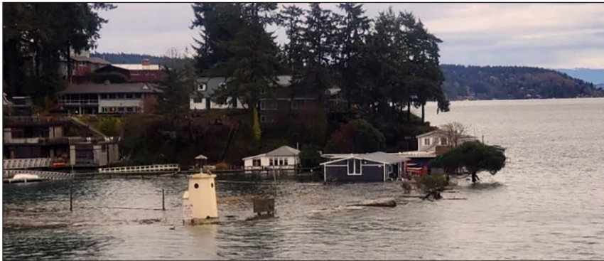
Above: flooding caused by a king tide in Gig Harbor in 2022.

WSG supports the rollout of the Coastal Storm Modeling System (CoSMoS) in Washington state