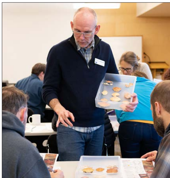
From top: part of Molt Search training is learning to properly measure molts across the widest part of the shell; Molt Search asks volunteers to collect any crustacean molts they find and trains them to distinguish European green crab molts from the molts of native crabs.