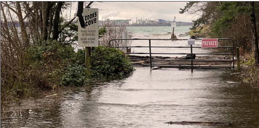
King tide flooding at Cooks Cove, Guemes Island, 2022.

the funded project will allow the Washington Department of Transportation to update its 2011 climate impacts vulnerability assessment. WSG will provide technical expertise in incorporating new data and tools, including up-to-date local sea level rise projections, into this assessment. WSG will also join the project team in working with local partners to identify three to six nature-based hazards resilience projects to implement at the community level. WSG will help to develop and implement community and stakeholder workshops toward this goal, as well as serve as a liaison between this project and other sea level rise and climate adaptation projects in Washington state.