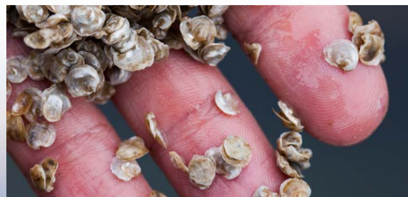
Juvenile oysters are particularly susceptible to acidification because it disrupts shell growth.