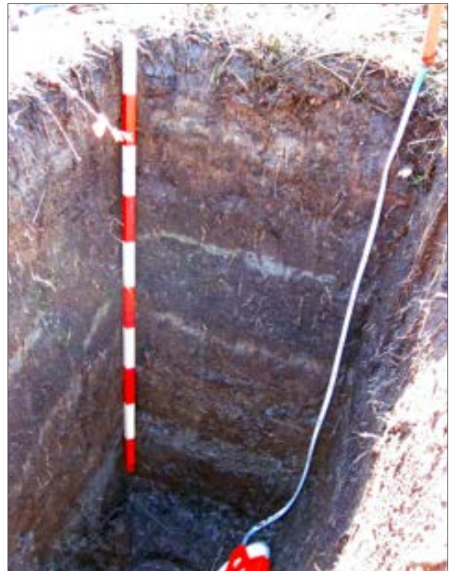
Light colored sand layers from four tsunamis in the last 1,000 years at Discovery Bay, Washington.